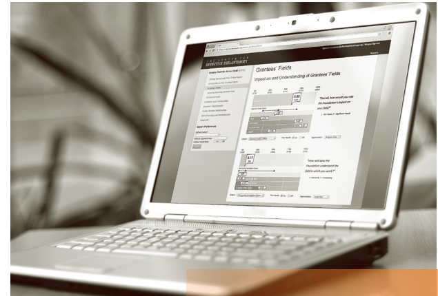
New Online Reporting System

In 2012, CEP provided 64 foundations with 76 assessment tools. In aggregate, CEP has now worked with 17% of the foundations we seek to work with. A major focus for the tools team this year was the development of a new format for the delivery of our data. Our new online reporting system will be used for the first time with surveys launched in May of 2013.