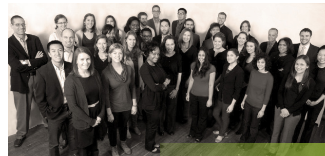
CEP Staff, December 2012